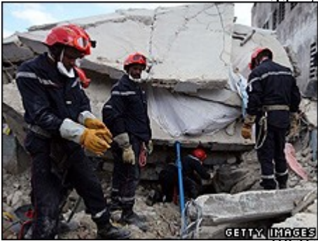
Many rescuers such as these from France are doing their part to help return Haiti back to normal.

itself, one must wonder what they can do. Well the answer is simple; most companies have links for easy donations. To help the heart-wrenched Haitians, just go to a website and do your part.